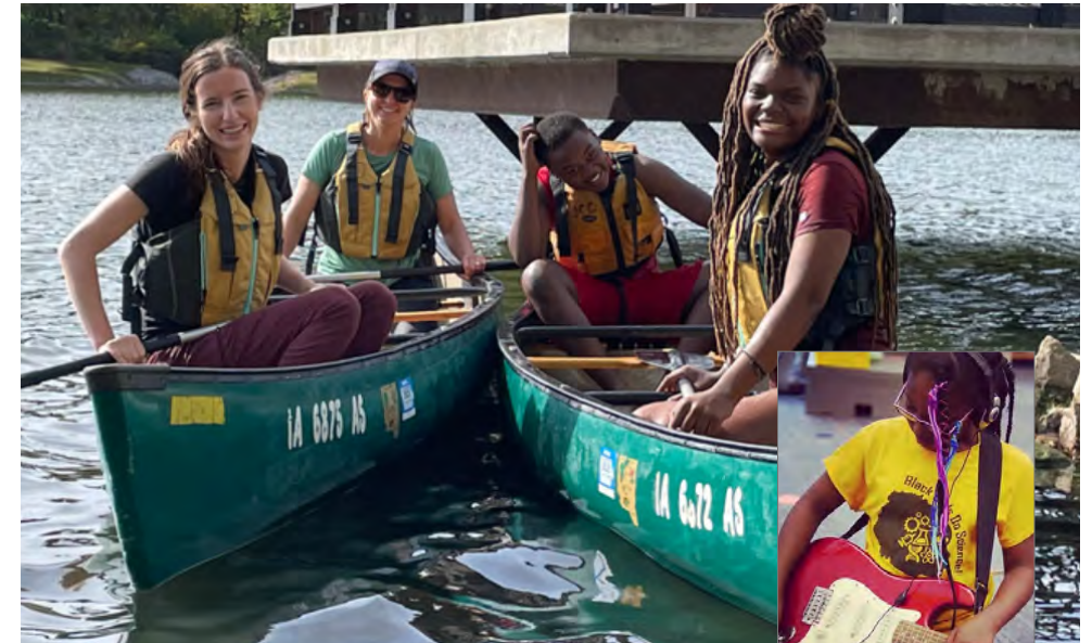
United Action for Youth (UAY) offers students access to free instrument lessons for all youth to create, grow, and succeed.

Established in 1970, United Action for Youth (UAY) ensures there are safe spaces for youth in Johnson County, Iowa, and surrounding areas. Last year, UAY served 2,701 individuals including 2,427 children and 163 parents with services that address mental health, young parent, and homeless youth. See how a Maximus Foundation grant made a lasting difference in their community on the Foundation's Insights Blog .