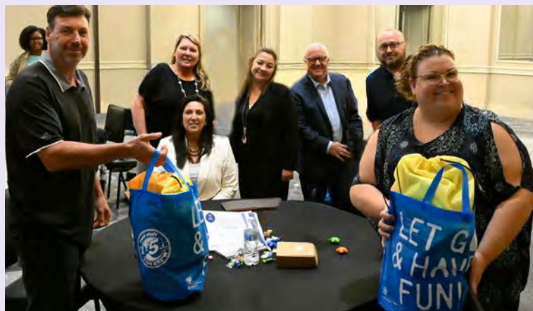
Maximus employees assembling Feel Better Bags