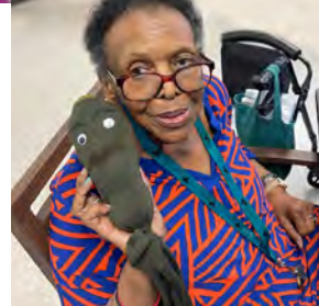
Participants enjoy activities at the PACE Day Center