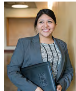
JVS SoCal program participant receives a certificate for completing training course.

JVS SoCal helps job seekers gain the skills and confidence they need to succeed in the workforce by providing no-cost job training, placement services, and career training programs. With 32,000 people served across their programs, JVS SoCal helps clients find sustainable employment and build successful careers with opportunities for advancement. Maximus and JVS SoCal have worked together for more than two decades to support Los Angeles County's GAIN (Greater Avenues for Independence) program, providing vocational training for nearly 15,000 welfare-to-work recipients. As the only two providers contracted for the program, close collaboration and communication have created a high-performing team that has generated exceptional results for the program and the recipients it supports. Learn more on how they are transforming communities with the support of a Maximus Foundation grant on the Foundation's Insights Blog .