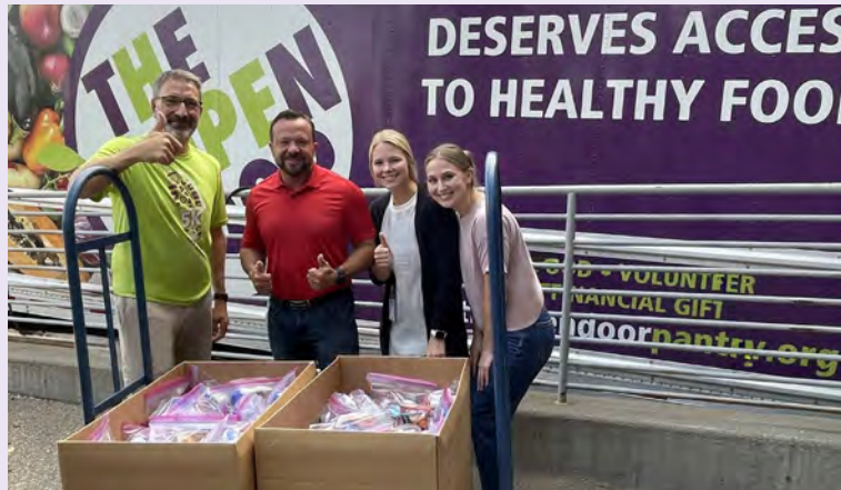
Corporate IT office in Eagan, Minnesota, gives back to The Open Door.