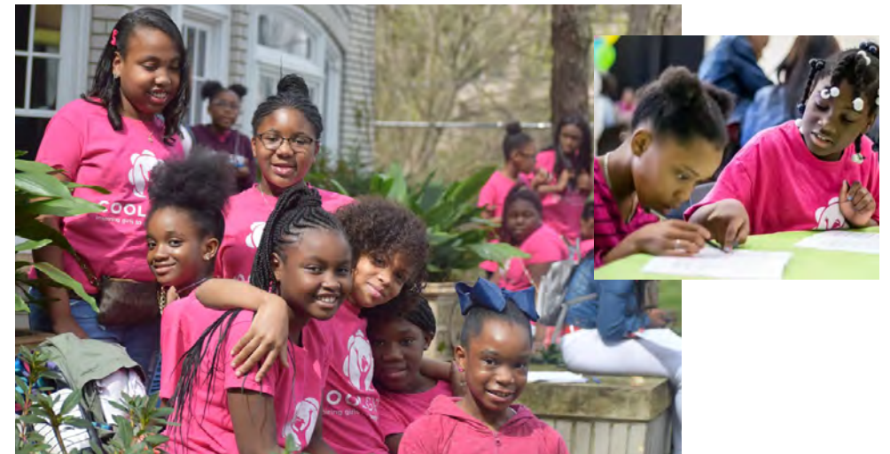
Cool Girls offers a weekly after-school program, the Cool Girls Club, for 300 girls from second through eighth grade. The program is aimed at underserved communities and allows girls to receive academic support or participate in science and technology, nutrition, or life-skills education programs.

Having served more than 6,000 girls throughout its 27-year history, Cool Girls develops bonds with girls and their parents, empowering Atlanta girls by breaking the cycle of poverty, low self-esteem, and teen pregnancy. Cool Girls dedicates its mission to helping girls in the Atlanta area make smart choices, providing them with learning opportunities and the inspiration to change the world. Learn more on how they are transforming communities with the support of a Maximus Foundation grant on the Foundation's Insights Blog .