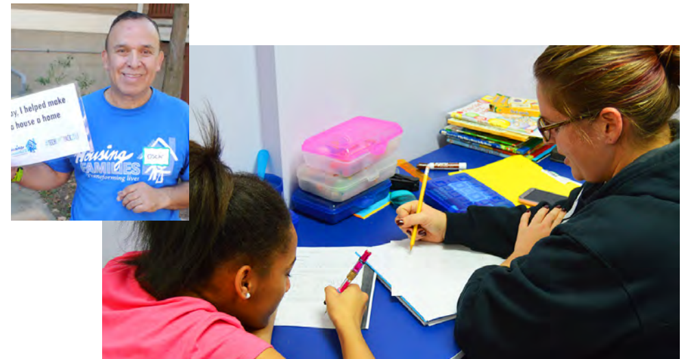
Housing Families provides a safe place for their patrons to call home.

Serving the greater Boston area, Housing Families uplifts individuals and families through a holistic approach to housing stability through personalized services, including temporary and permanent housing, food assistance, individual counseling and group therapy, legal assistance, and youth programs. In 2022, they served 3,300 individuals across various programs on homelessness prevention, child hunger and nutrition services, and youth enrichment and education programs. Learn more on how they are transforming communities with the support of a Maximus Foundation grant on the Foundation's Insights Blog .