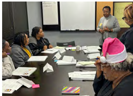
RISE Silver Neighbors workshop participants