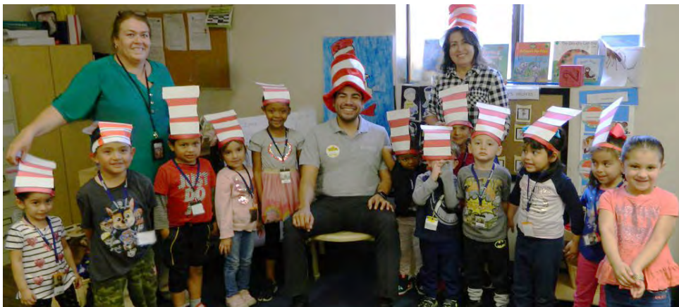
Catholic Charities Community Services Arizona provides critical services and support to the Phoenix area's most under-resourced populations.

Catholic Charities Community Services Arizona (CCCSA) has served Phoenix since 1933, providing critical services and support to the area's most vulnerable populations, including Veterans and their families, sex-trafficked survivors, victims of domestic abuse, refugees, and those experiencing homelessness. Through the support of funding from the Maximus Foundation, Westside Head Start (WSHS) program at CCCSA was able to hire a new mental health coordinator who aids teachers in identifying children who may need additional social and emotional support to be successful in school. Learn more on how they are transforming communities with the support of a Maximus Foundation grant on the Foundation's Insights Blog .